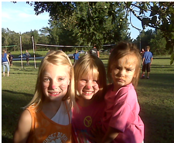
Pretty smiling faces.