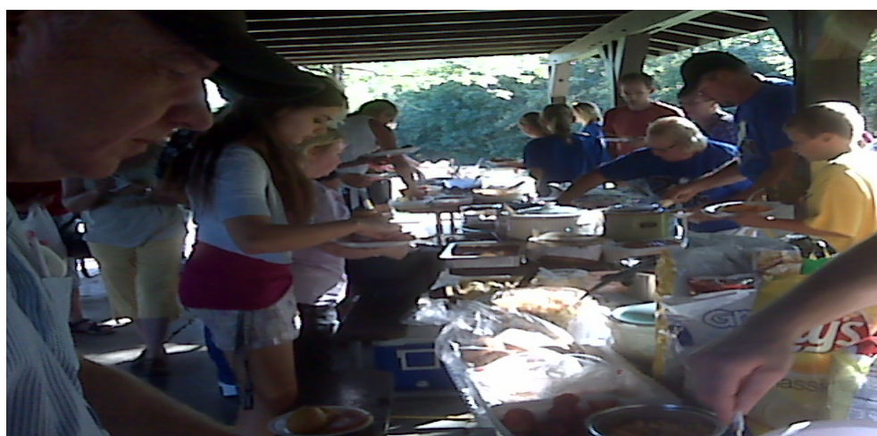
Everyone lined up for chow!!