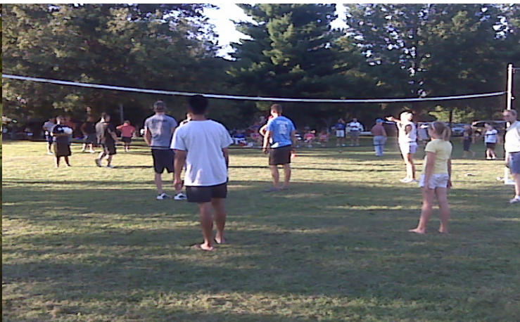
This is the pro volleyball team. Pretty sharp huh!!!!